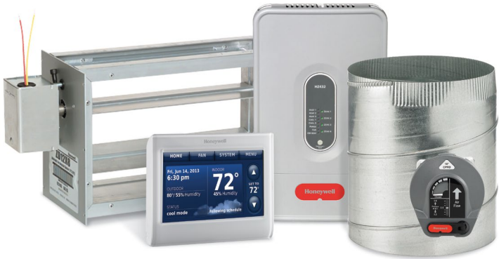
ZD Damper | Prestige® Thermostat | TrueZONE® Panel | TrueZONE Bypass

With this convenient Honeywell zoning worksheet, you can walk through a complete set of zoning system materials to ensure that you have everything you need. Then use the completed worksheet to create the bill of materials for your zoning project, making ordering easier than ever.